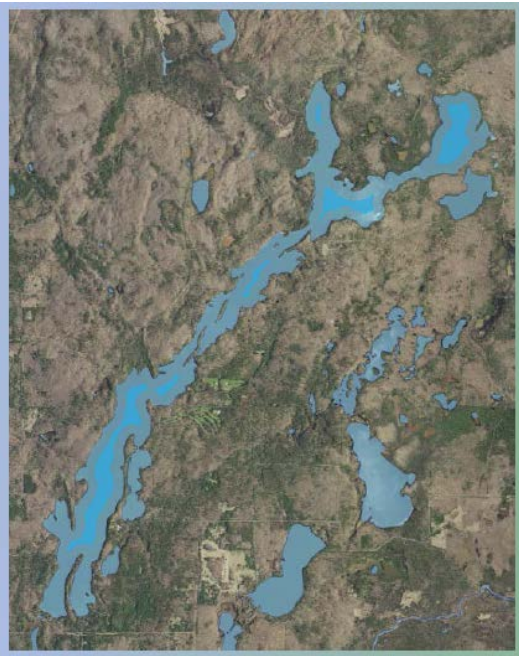
500 foot setback on Lake Owen